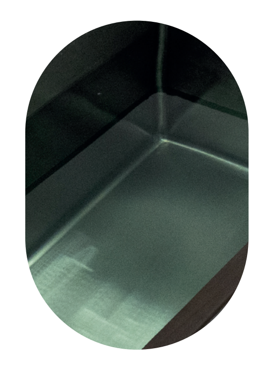
Ozone and Filtration systems