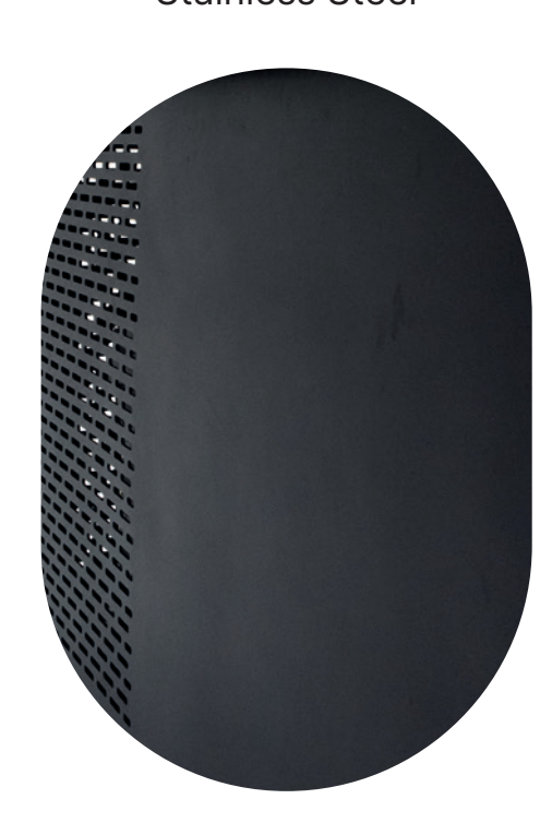
Black Aluminium Surround